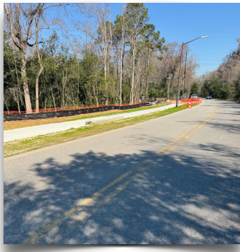
Reuben Clark Drive

Construction for Truman Linear Park Trail Phase 2B was approved by City Council on February 8, 2024. The contract was awarded to JHC Corporation out of Newnan, Georgia at a cost of $8,193,540. Tide to Town is largely funded by the hotel/motel tax which granted the project a total of $10 million through a resolution passed on May 24, 2023. Tide to Town also received funding from SPLOST VII and the American Rescue Plan Act (ARPA). In the wooded area along Reuben Clark Drive (the street which connects DeRenne Avenue with the Memorial Hospital campus over the Truman Parkway), lighting and Emergency Call boxes are being installed. As of the date of this newsletter, construction from Reuben Clark Drive and parallel to the Truman Parkway is underway, which will