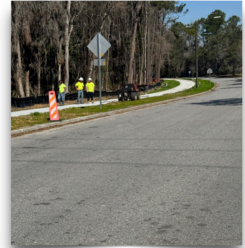
DeRenne Avenue & Reuben Clark Drive

The new phase of the Tide to Town trail will be a 10-foot-wide concrete path with a timber bridge ditch crossing and includes an 8-foot-wide protected, shared-use path across the 52nd St. bridge over the Truman Parkway.