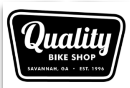
Montgomery Cross Road, Savannah

If you're in need of bikes, bike equipment or repairs, visit any of these shops and receive 10% discount on parts and accessories, by mentioning you are a CBTC member.