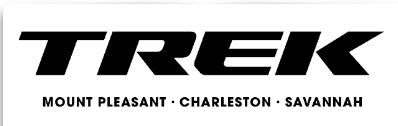
Pennsylvania Avenue, Savannah