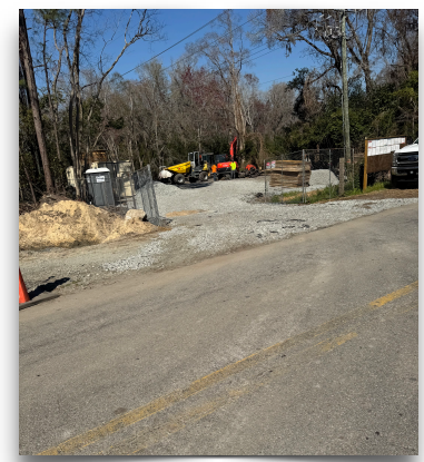
Leading to the 52nd Street bridge

Tide to Town is an initiative to create a system of trail ways connecting Savannah’s neighborhoods to safe, affordable and cost-effective walking and biking infrastructure encouraging long-term socio-economic development. The map below, while busy, shows (in red) the Tide to Town trail, as well as the proposed trail (in blue) to Enmarket Arena, along the Ogeechee Canal.