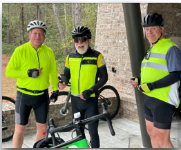
Rest stop - Wormsloe