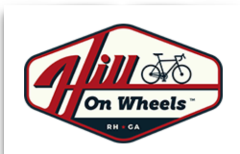
Ford Avenue, Richmond Hill