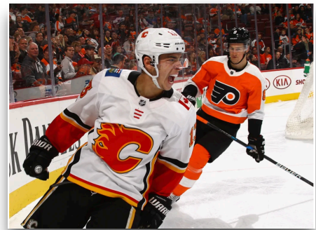
Johnny Gaudreau - Calgary Flames

The National Highway Traffic Safety Administration (NHTSA) reported that 1,105 bicyclists died in 2022 due to motor vehicle crashes. While 2022 was the first year that motorized bicycles were included in the tally, this figure trumps the number of deaths in previous years, including in 2021 (976), 2020 (948), 2019 (859) and 2018 (871).